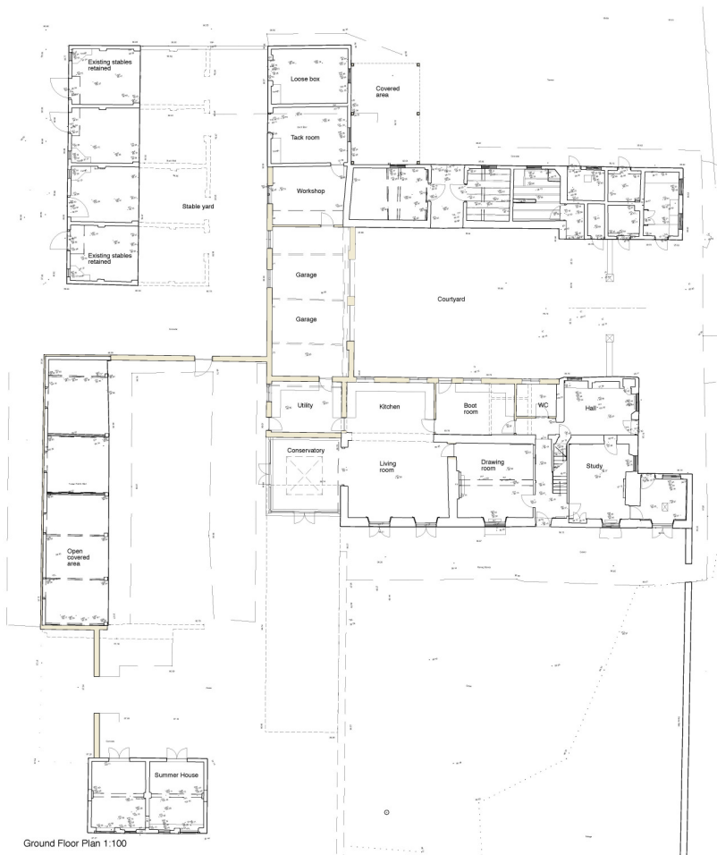
Ground Floor Plan 1:100