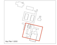
Key Plan 1:2000

1. 1:1000 A1 2. 1:1000 A1 3. 1:1000 A1 4. 1:1000 A1 5. 1:1000 A1 6. 1:1000 A1 7. 1:1000 A1 8. 1:1000 A1 9. 1:1000 A1 10. 1:1000 A1