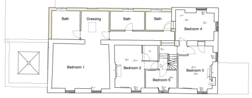
First Floor Plan 1:100